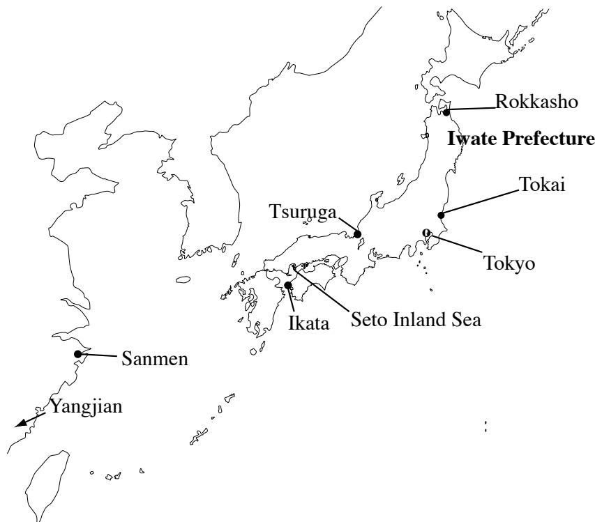
Map of places mentioned in NIT 105