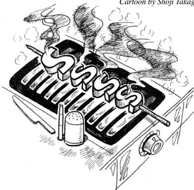
4S Kebabs: Simple Safe and Super-Salty

Using plutonium or uranium enriched to around 20% or 25% raises proliferation issues. Despite claims that 4S is proliferation resistant, using plutonium or uranium means that there must be supplies of this type of fuel. Creating a new market for this type of fuel will inevitably create additional proliferation risks. There is also the nuclear waste problem, of course. Regardless of whether this burden is borne by Galena, there is still no solution to the problem of nuclear waste.