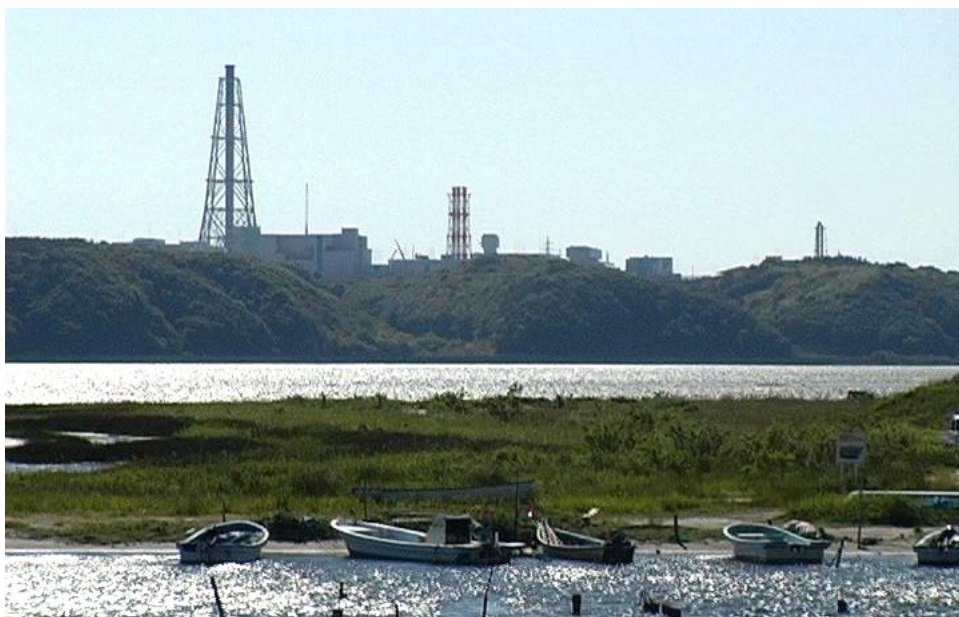
The Rokkasho Reprocessing Plant

http://www.g-gendai.co.jp/company/english.html