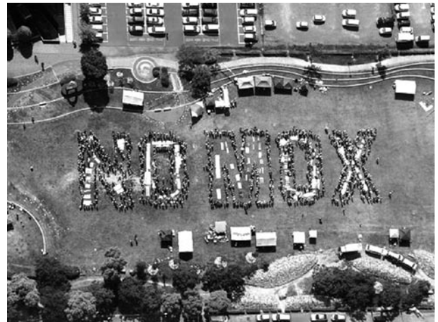
Demonstration in Saga, May 10

On March 18th, shortly after the MOX fuel shipment left Cherbourg, Eni F.H. Faleomavaega (member of the US Congress, House of Representatives from the Territory of American