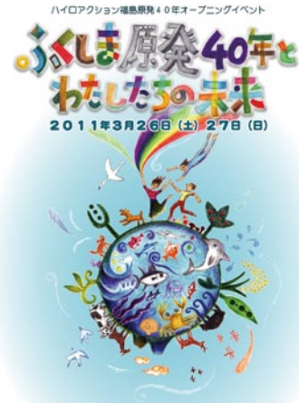
Poster for the opening event of Hairo Action

Now is indeed the time for the world to make up its mind to phase out nuclear power. We, the Hairo Action Fukushima, will continue to work hand in hand with the people of the world to prevent any expansion of the current disaster and any repeat of this terrible tragedy.