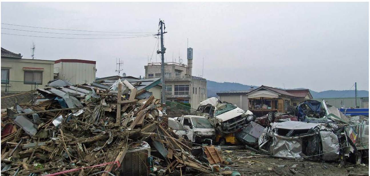
Photograph of disaster waste in Kesennuma City, Miyagi Prefecture, on May 1, 2011

The Tokyo area has also seen incidents of radioactive waste occurring in normal waste and in incinerated ash in sewage mud, and this waste material is being stored.