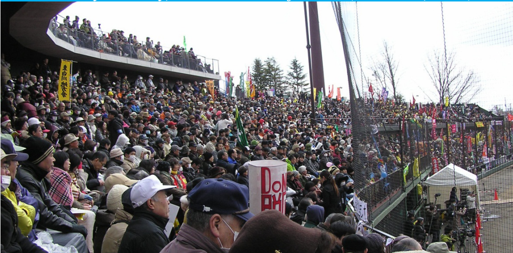
Rally attended by 16,000 antinuclear protesters in Koriyama City, Fukushima Prefecture. (March 11, 2012)

Both Mayor Hashimoto and Governor Ishihara are opposed to a referendum. The chances of a referendum actually being held by the City Council of Osaka or the Tokyo Metropolitan Assembly are unfortunately slim.